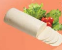
#22662 Fresh Mozzarella Loaves 3/3 lb.