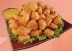
#37059 Fully Cooked Popcorn Chicken Fritters 2/5 lb.