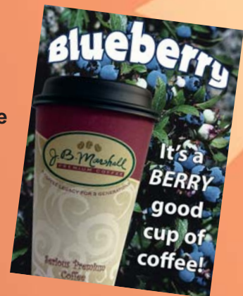
#316 Blueberry Flavored Coffee 20/2.25 oz.