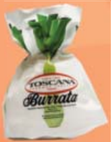
#22790 Fresh Burrata Mozzarella 6/8 oz.