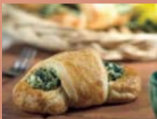
#31602 Spinach & Feta Cheese Croissant 54/5.1 oz.