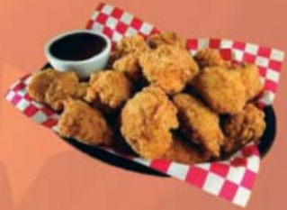
#37068 Fully Cooked Country Style Breaded Boneless Chicken Wings 10 lb.