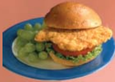
#37204 Fully Cooked Breaded Chicken Breast Filets 40/4 oz. 10 lb.