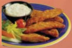
#37042 Fully Cooked "Fiery" Chicken Fingers avg. 188/.85 oz. 10 lb.