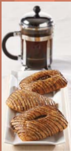
#31610 Strawberry Cream Cheese Croissant 84/3.8 oz.