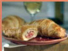
#31600 Ham & Swiss Cheese Croissant 54/4.8 oz.