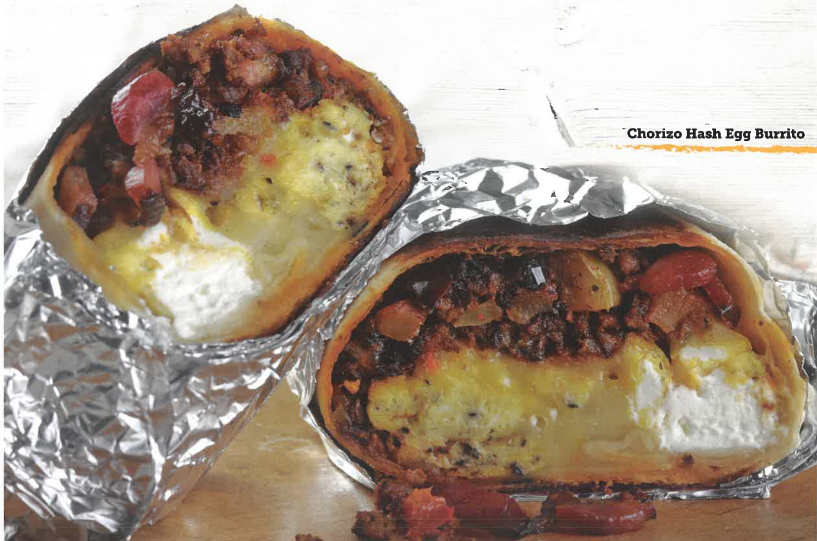
Chorizo Hash Egg Burrito

It's gotta be fast, it's gotta be convenient, and it's gotta be delicious. It's gotta be from Smithfield!